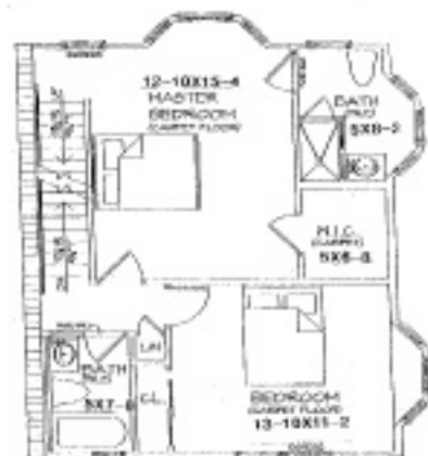
PLAN OF 3rd FLOOR