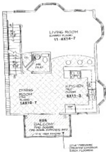
PLAN OF 2nd FLOOR